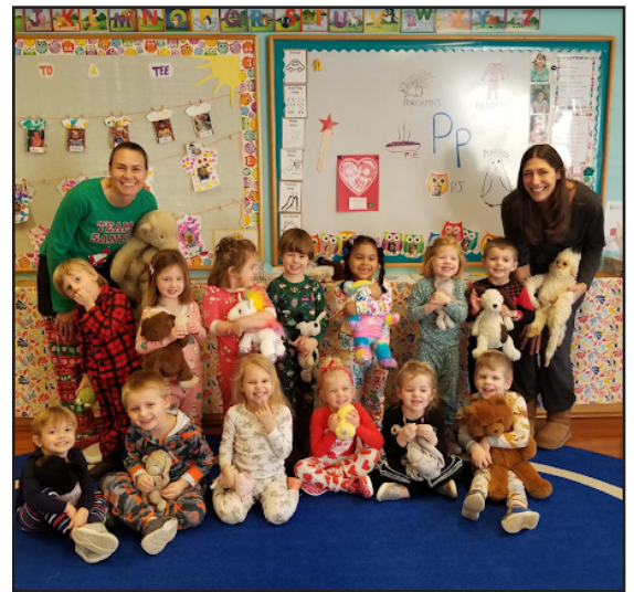
Come in your PJ day at FUMP!