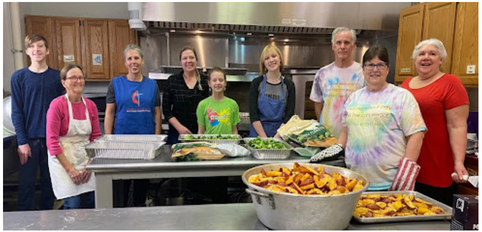
Youth in our church family spent their day off from school helping at 'Bread and Blessings' (Soup Kitchen) on Presidents Day!

Mark your calendars for April 15, and stay tuned for details as the day approaches.