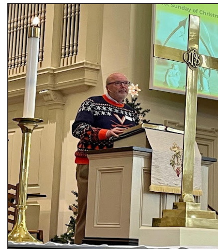
Picture is from the December 26 service of Ugly Sweaters, Pajamas and Christmas Carol Sing!